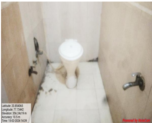
At Woman Hostel