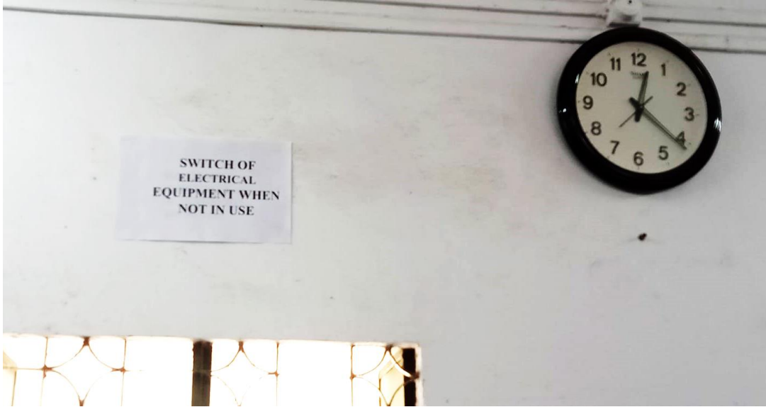
Notices /Flex To Save Energy