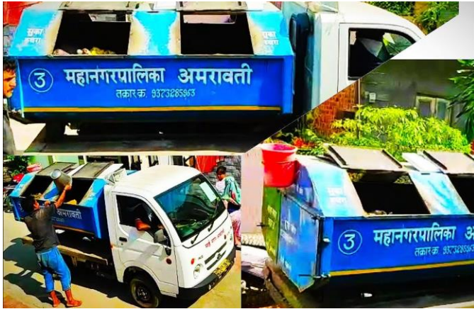
Solid Waste Degradable Collection by Muncil Corporation Amravati