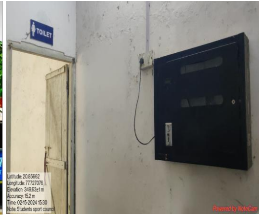
Sanitary Vending Machine