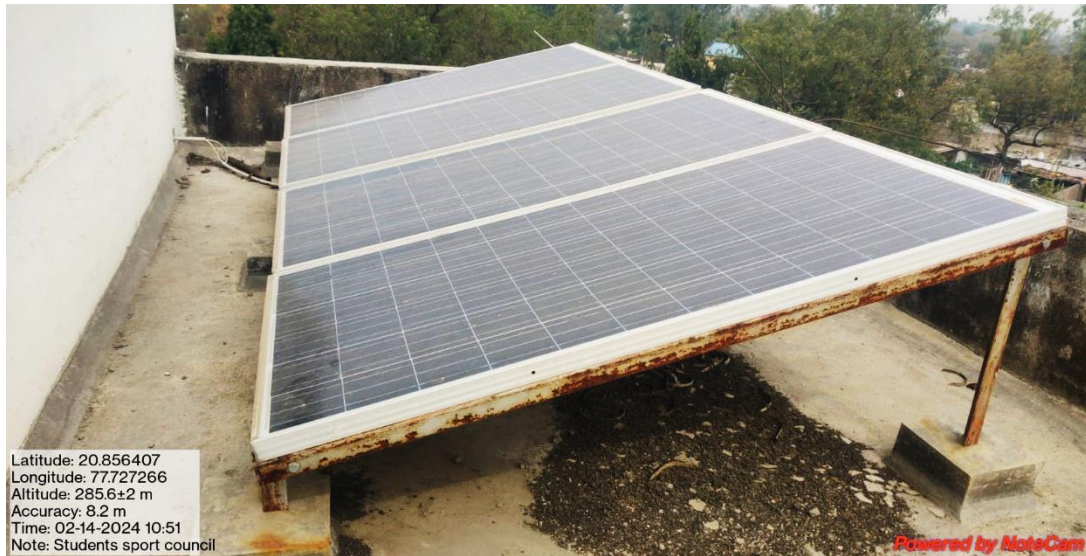
Solar panels (1.1 KV)