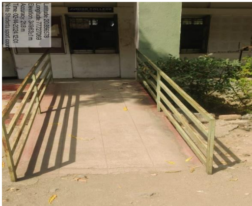
Ramp at Office