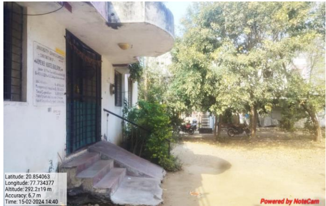
Ramp at Woman Hostel