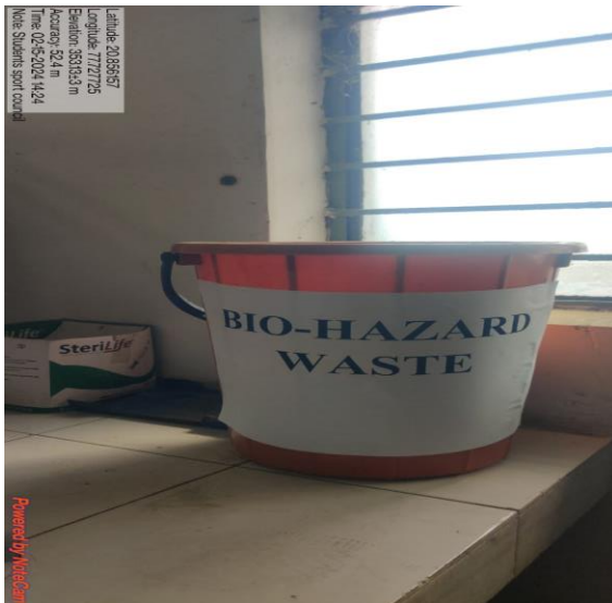
Bio-Hazard Waste Bins